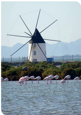
Molino de la Calcetera